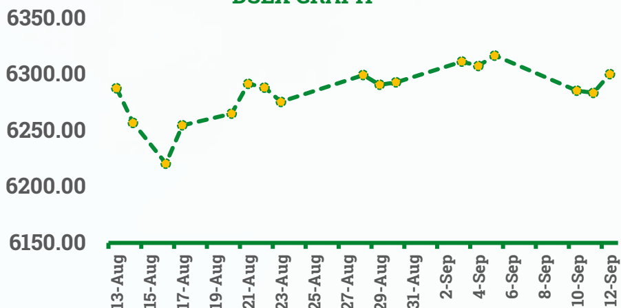
GRAPH OF DS30 INDEX